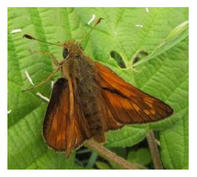
This large skipper brought the number of species of butterfly found on Troopers to 23 in June 2014

Lichen and fungi to be found on Troopers Hill - we are prouder of our waxcaps but the fly agaric does make a striking image