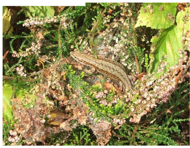
Page 5 of 5