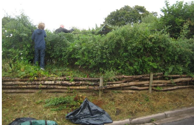
Page 4 of 5