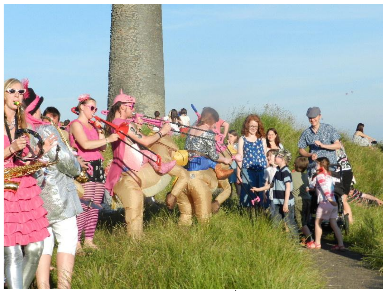
Work Party of Saturday 5<sup>th</sup> July