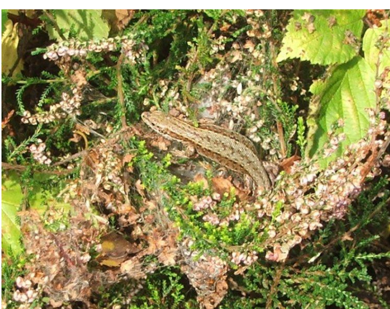
Page 6 of 6